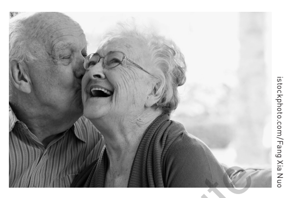
Despite the lack of media images of sexually active senior citizens, sexuality can be enjoyed across the life course.

Despite such cultural and academic neglect, sexuality can be enjoyed throughout the life course. Pharmaceutical companies trafficking in drugs like Viagra and Addyi (known as the "female Viagra") send a mixed message (see Chapter Eleven). The first unmistakable message is that aging results in inevitable sexual dysfunction. For men this takes the form of erectile dysfunction while for women it takes the form of an abnormally low sex drive. The second message being sent is that seniors have a right to remain sexually active; that geriatric sex is not a contradiction in