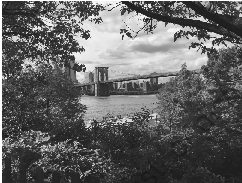
Figure 1.2 View of the Brooklyn Bridge From the Brooklyn Bridge Park Greenway