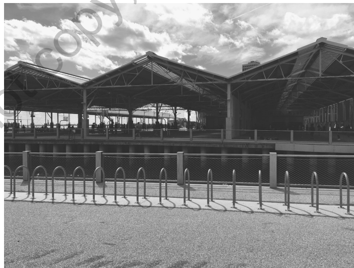
Figure 1.1 Pier 2 at Brooklyn Bridge Park

In one of Kahneman and Tversky's classic examples, participants were presented with the following: "All families of six children in a city were surveyed. In 72 families the exact order of births of boys and girls was GBGBBG. What is your estimate of the number of families surveyed in which the exact order of births was BGBBBB?" (Kahneman & Tversky, 1972, p. 432). Not surprisingly, a significant number of the respondents (75 of 92) said the second option was less likely to occur because, as Kahneman and Tversky argued, it seems less representative of the population. When the question is posed in terms of the frequency with which two birth sequences occur (BBBGGG vs. GBBGBG), the same participants pick the second sequence. The first looks "fixed" or nonrandom to us (and them). How representative something looks is one heuristic or bias that may influence the research process. A researcher might select a stimulus (e.g., photograph) as representative of a population of interest (e.g., urban parks) without knowing the full range of existing sites (compare Figure 1.1 and Figure 1.2). In this instance, both of these photos come from the same park (Brooklyn Bridge Park in Brooklyn, New York) but would communicate very different aspects of the park