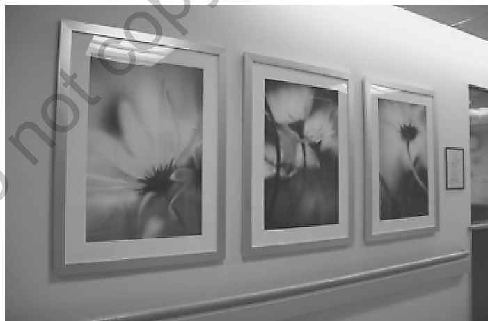
Figure 1.4 Examples of Representational Images of Nature

Paradigm: In science, an overarching approach to a field of inquiry that frames the questions to be asked and how research is conducted.