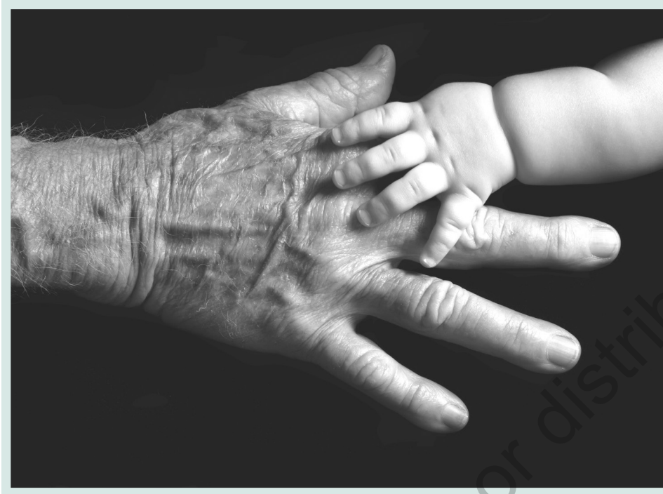
PHOTO 1.2 The journey of human development, from infancy to elderhood, continues to evolve during the lifespan.