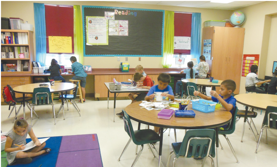
This class has a Fiction Writing station and another Nonfiction Writing station on the countertop by the windows.