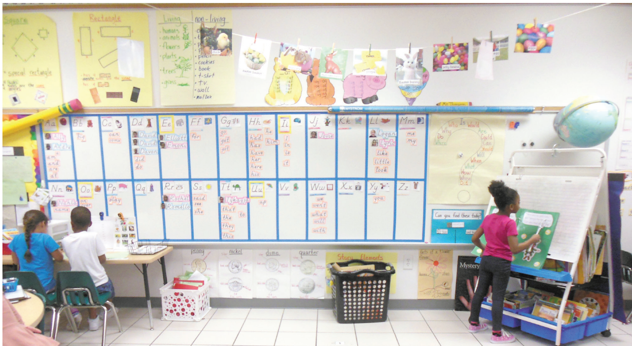
Two students work at a Writing station.