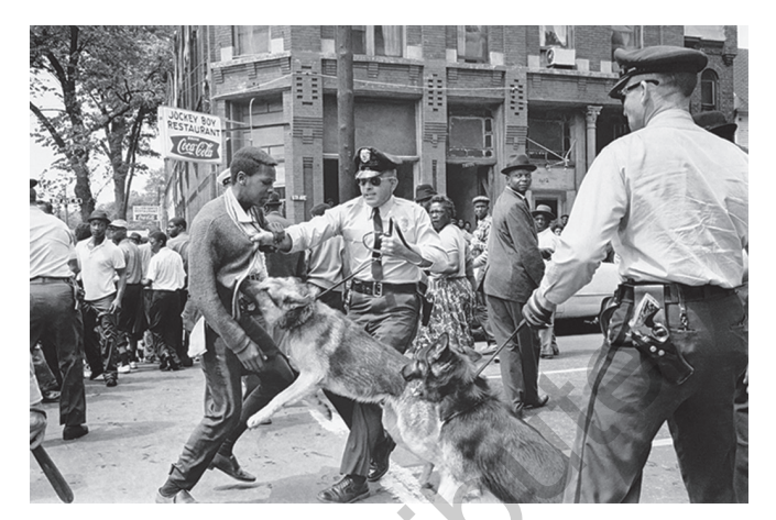
May 3, 1963: a 17-year-old civil rights demonstrator in Birmingham, Alabama, is attacked by a police dog.

In an article published in 1933, August Vollmer outlined some of the significant changes that he believed had taken place in American policing from 1900 to 1930. The use of the civil service system in the hiring and promotion of police officers was one way to help remove politics from policing and to set standards for police recruits. The implementation of effective police training programs was also an important change during this time. The ability of police administrators to strategically distribute police force according to the needs of each area or neighborhood was another change made to move toward a professional model of policing. There was also an improved means of communication at this time, which included the adoption