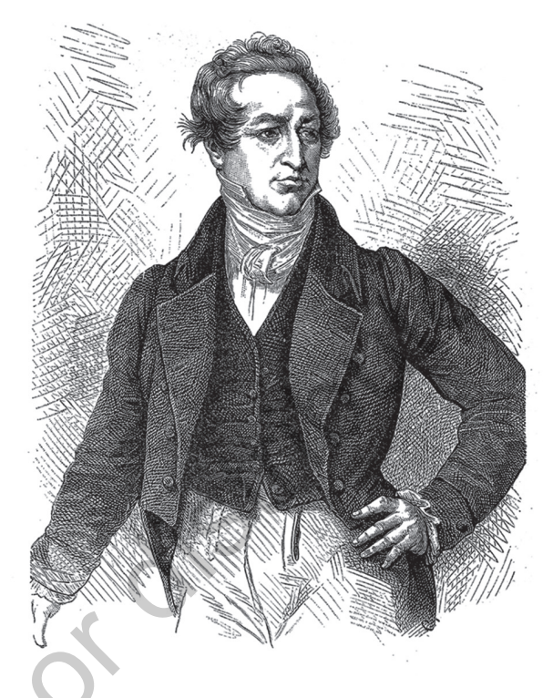
Sir Robert Peel was the founder of the London Metropolitan Police Department.

In 1829, Sir Robert Peel (Home Secretary of England) introduced the Bill for Improving the Police in and Near the Metropolis (also referred to as the Metropolitan Police Act) to Parliament with the goal of creating a police force to manage the social conflict resulting from rapid urbanization and industrialization taking place in the city of London.<sup>19</sup> Peel's efforts resulted in the creation of the London Metropolitan Police on September 29, 1829.<sup>20</sup> Historians and scholars alike identify the London Metropolitan Police as the first modern police department.<sup>21</sup> Sir Robert Peel is often referred to as the