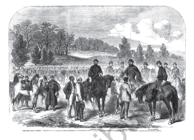
Slave patrols in the southern region of the United States are believed by some historians to be the first formal police organizations.

While some regard slave patrol as the first formal attempt at policing in America, others identify the unification of police departments in several major cities in the mid-1800s as the beginning point in the development of modern policing in the United States.<sup>46</sup> For example, the New York City Police Department was unified in 1845,<sup>47</sup> the St. Louis Metropolitan Police Department in 1846,<sup>48</sup> the Chicago Police Department in 1854,<sup>49</sup> and the Los Angeles Police Department in 1869,<sup>50</sup> to name a few. These newly created police agencies adopted three distinct characteristics from their English counterparts: (1) limited police authority—the powers of the police are defined by law; (2) local control—local gov-