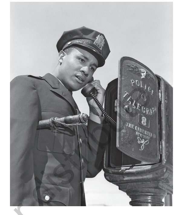
Call boxes were the most common form of communication used by police officers during the political era.

A patrol sergeant escorted him to his post, and at hourly intervals contacted him by means of voice, baton, or whistle. The sergeant tapped his baton on the sidewalk, or blew a signal with his whistle, and the patrolman was obliged to respond, thus indicating his position on the post.<sup>75</sup> Sometime in the mid- to late 1800s, call boxes containing telephone lines linked directly to police headquarters were implemented to help facilitate better communication between patrol officers, police supervisors, and central headquarters.<sup>76</sup> The lack of police supervision coupled with political control of patrol officers opened the door for police misconduct and corruption.<sup>77</sup>