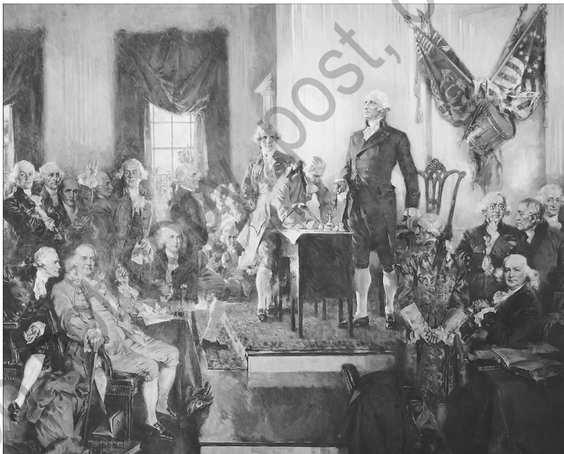
Photo 1.3 George Washington presides over the signing of the Constitution by members of the Constitutional Convention in Philadelphia on September 17, 1787. This depiction of the event was painted by Howard Chandler Christy and hangs in the U.S. Capitol.

In its draft of the Constitution, the Committee of Detail followed the convention’s wishes and gave the president relatively little power. That it gave the president a specific constitutional grant of power at all, however, was significant. The alternative would have been to follow Sherman’s suggestion and allow Congress to dictate presidential powers. The Committee