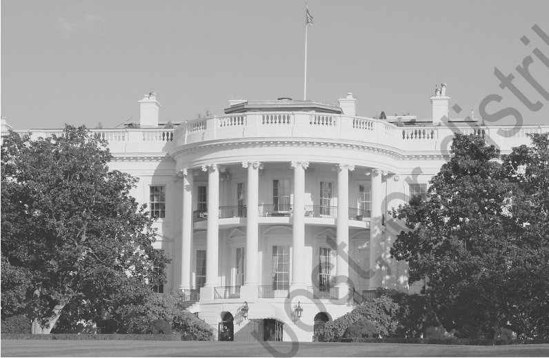
Photo 1.1 The White House—nerve center of the executive branch and home of its chief.