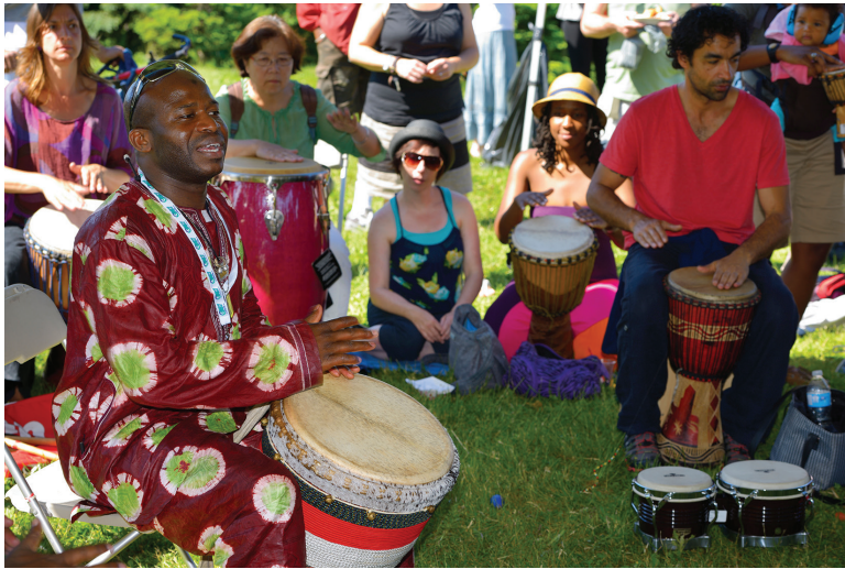
The extent to which we tolerate and respect cultural practices varies around the world.