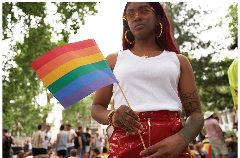
Various co-cultures remain important sources of information on how people communicate.

As a country, the United States demographic has changed vastly and rapidly. The homogenous nature of culture, as you now know, has been replaced with a