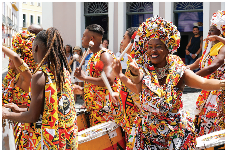
Cultural understanding is usually passed on from generation to generation.

Learning cultural rituals is typically undertaken by generations. For example, baby boomers pass along cultural values and practices to Millennials who then may pass them along to Generation Z. Yet, the cultural practice can evolve significantly. Think about dating over the generations, for instance. Even in the late 20th century, Baby Boomers rarely lived together and were still asking parents for permission to get married. As Millennials began to date, they not only often abandoned the "permission" behavior, but even cohabited before making any decision—if any—related to marriage. And, Generation Z—the "tech generation"—not only has used dating apps to find partners, but have also "ghosted" their partner and even texted them to let them know that a long-term relationship is now over! Identifying with one generation may be age-dependent; baby boomers who are in their 60s may