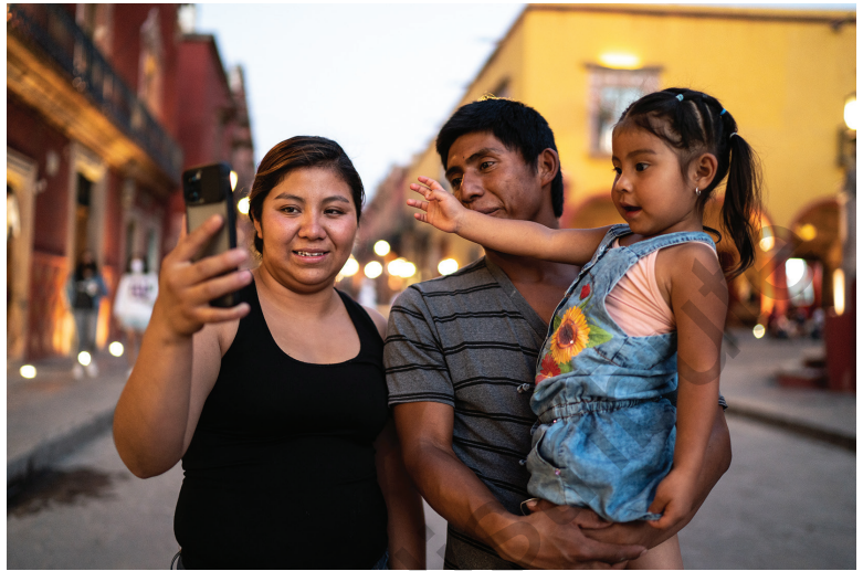
Mobile technology can bring culturally diverse people together, with connection, information, and communication at their fingertips.

A third way in which your role as a college student affords you intercultural understanding is through the courses in which you enroll. For instance, it’s likely that you are required to take courses in your General Education related to U.S. Diversity and Global Diversity. Further, there are college courses dedicated to culture and diversity with titles such as “Religions of the World,” “War, Genocide, and HIV in Africa,” “Gender and Sexuality,” “American Sign Language,” “American Indian History,” among many, many others. Further, at many colleges and universities, students can major in international business, cultural and critical studies, queer studies, among others. Finally, college students across the world are able to enroll in Study Abroad programs, enabling them to be part of a cultural immersion experience in countries around the