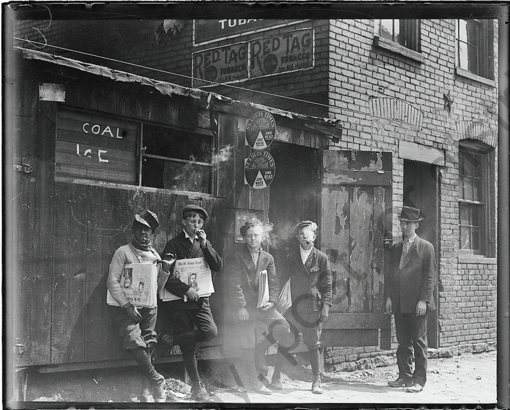
U.S. National Archives and Records Administration