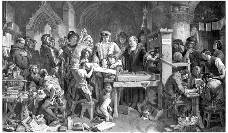
The development of the printing press brought about a major shift in many societies' ideas about childhood and the needs of young people.