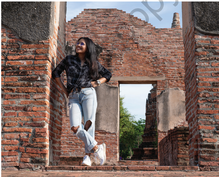
Although young people engaged in behaviors that we would label as delinquent today, they were not labeled as such in ancient times.

Life was not easy for children of this period, and they were often subjected to practices of abuse and neglect that resulted in short life spans. 12 Those who did survive engaged in many of the same activities as adults, including drinking alcohol, gambling, and engaging in sexual behavior. These behaviors were accepted among youth, and adults did not see any need to shelter their children from what are seen today as adult behaviors; extended families and communities lived very closely together, and there was very little privacy to be had, even if it was desired. Everyone had an eye on one another, and this informal social control kept a lot of young people from misbehaving.