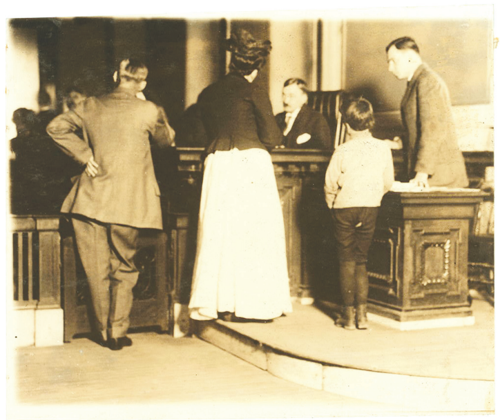
The creation of juvenile courts at the turn of the 20th century marked a new era in how youth were dealt under the law.

The views about youth upon which the juvenile court was based were not questioned in any substantial way until the 1960s. 52 The 1960s were a time of a rise in the teenage population as the large population of children born after World War II (i.e., the generation known as the baby boomers) entered adolescence. This generation garnered quite a bit of attention and, as a subset, experimented openly with drugs, protested against social and legal institutions, and rose up against the status quo. The group's actions were often tied to the many movements for social change that had grabbed the attention of the public during this period of U.S. history. Large numbers of people had become active in social movements such as the civil rights movement, the peace movement (also known as the anti-Vietnam War movement), and the feminist movement, all of which shared concerns about legal fairness and equality.