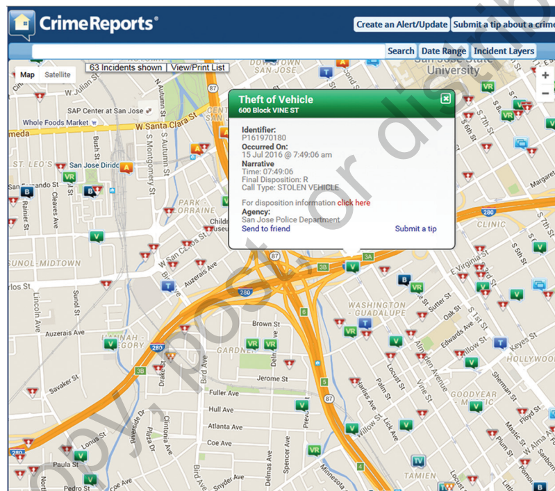
FIGURE 2.5 ■ The San Jose Police Department Interactive Crime Map