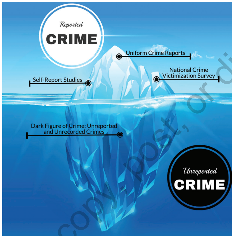
FIGURE 2.1 ■ The Dark Figure of Crime

One often hears on the news or reads in the newspaper that crime is increasing or decreasing in certain communities, in certain cities, or on the whole. Often, these reports are based on official crime statistics or data on crime that have come to the attention of law enforcement. But some crimes do not come to the attention of law enforcement or other criminal justice agencies. These undetected, or unreported, crimes are referred to as the dark figure of crime or, as illustrated in Figure 2.1, the iceberg . Later in this chapter, we will cover one way of addressing these undetected or unreported crimes—by surveying victims of crime.