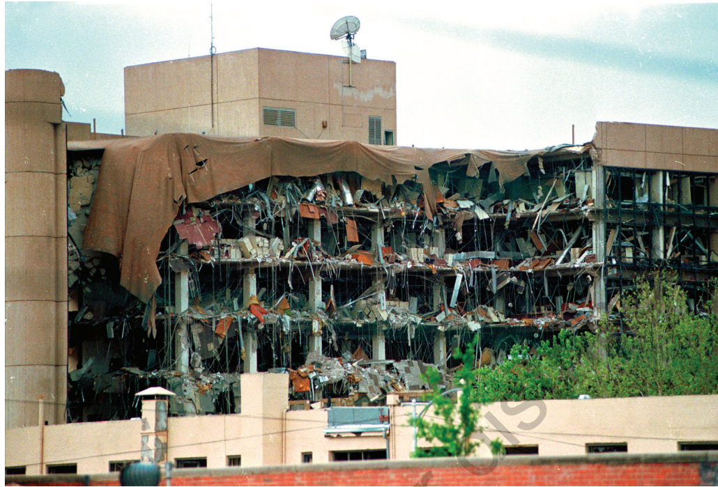
A bombing on April 19, 1995, devastated the Alfred P. Murrah Federal Building in Oklahoma City, Oklahoma. What challenges do horrific incidents like this pose for the reporting of crime statistics?