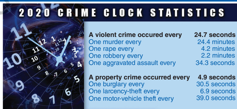
FIGURE 2.2 ■ Crime Clock