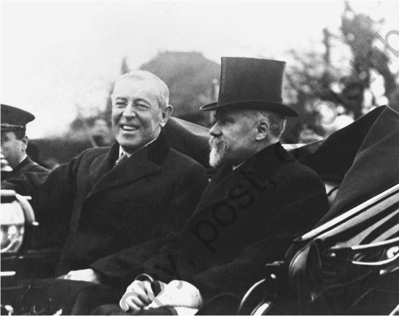
President Wilson with French president Raymond Poincaré

The American style of foreign policy was personified nearly a century ago by President Woodrow Wilson. Wilson, the son of a Presbyterian minister, often described world politics as a struggle between good and evil. The United States, he believed, had a moral responsibility not merely to promote its own self-interests, but also to free the interstate system from its anarchic structure and warlike tendencies.