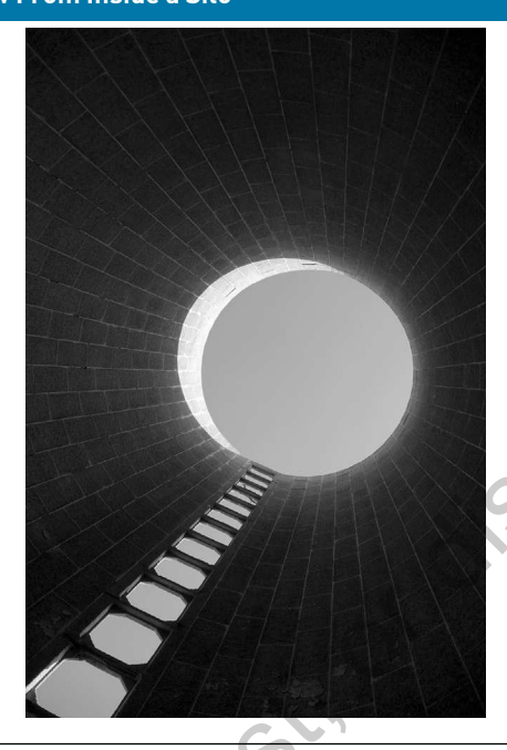
FIGURE 1.1 View From Inside a Silo