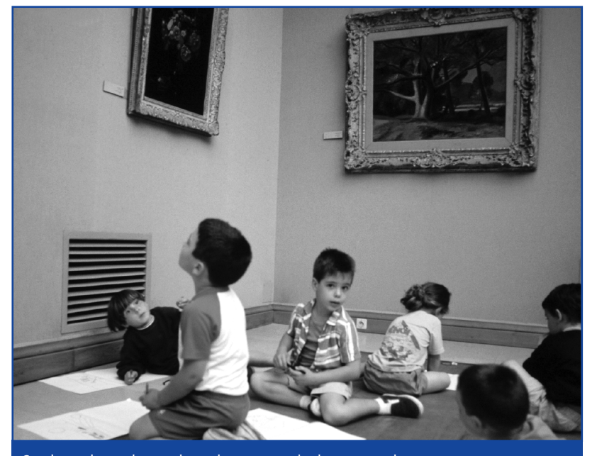
Students learn best when they are actively engaged.

Social studies should involve students in reading, writing, observing, discussing, and debating to ensure their active participation in learning. Teaching is far different from telling things to students. Instead, teaching is creating the conditions whereby students can learn, and students learn best when they are actively involved in the construction of knowledge. This can occur by using the best practices listed here as well as all the strategies and activities described in this book. These will also serve to enhance learning as well as to create interesting, multimodal learning experiences.