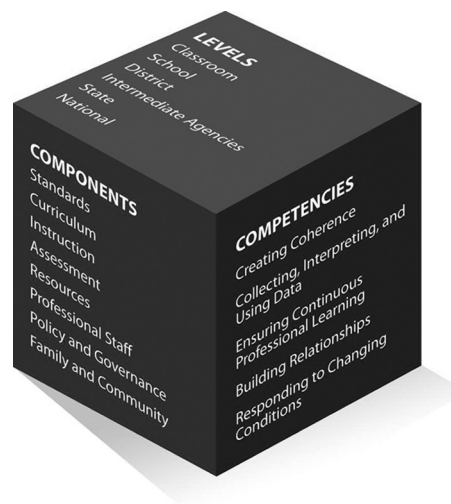
Figure 1 Working Systemically Dimensions

T he Working Systemically approach is a multidimensional process for school improvement that focuses on key components of the system that need to be considered in supporting student achievement. It also identifies a core set of competencies that leaders in the system need to develop as they address the components. In order to ensure that the improvement is sustained over time, the approach targets multiple levels of the system. The goal of the Working