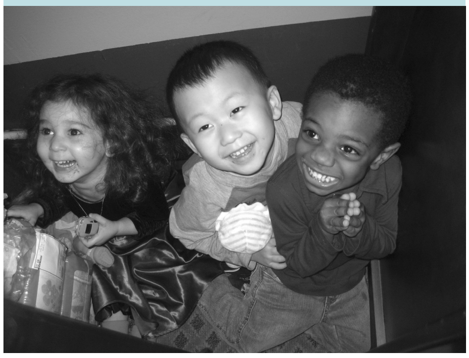
Photo 7.1 Do you see difference or similarity? Preference for people who think, look, and act like you is common. This perceived similarity both enhances friendships and limits opportunities to make friends. In this photo, group membership is not produced by visual race or ethnicity. Instead group membership is produced by the shared activities these children engage in and enjoy together.

People have many cultural identities that they can call upon. These might include being a student, a surfer, a sporty guy, and so on. Clearly, people can have multiple identities. A person can simultaneously be a Korean who values their ethnic heritage, but is also proud to have become an American citizen. Both components of this dual identity are salient, and each one is triggered on different occasions as being more central to who that person is at that moment. Korean Americans who visit Korea are often surprised—even