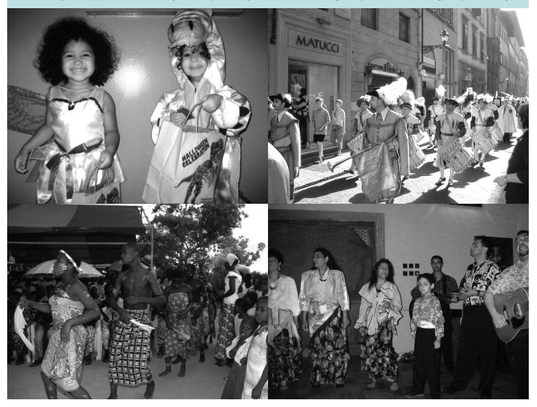
Photo 7.2 What value does celebration have to you? Celebrations and rituals such as those that occur for holidays, weddings, funerals, and parades have value for culture. For example, celebrations provide the opportunity for members of a community to show their cultural solidarity and pride. This may be especially important for groups with a low group vitality.

Just as important as objective vitality are its perceptual dimensions, namely subjective group vitality (Giles, Bourhis, & Taylor, 2009), that is, how people view their own and others group vitalities. It has been argued that we are aware of the vitalities of all the social groups to which we belong by mere (yet continual) perusals of media depictions and reports of relevant intergroup scenes. Further, ethnolinguistic identity theory contends that the higher your ingroup vitality, the more members are willing to invest in their ingroup emotionally,