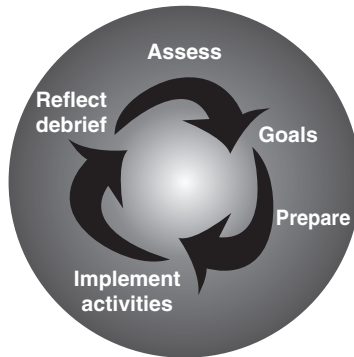
Figure 1.1 Coaching Cycle