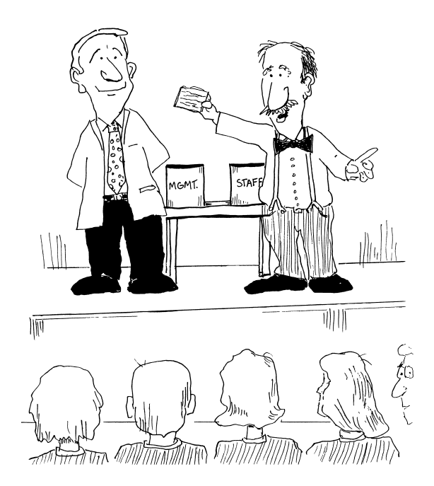
How It Works. At an event or meeting when all staff members are present, hold a lottery in which all supervisors' names are put in one container and all other staff members'

Have you ever found yourself saying, I wish my boss would do my job for one day—just one day! Then he or she would appreciate me , or My boss has no clue what it takes to do my job! Likely, we've all said something to that effect during our careers. Give some of the staff an opportunity to have their supervisors share their jobs through an "In-Touch Lottery."