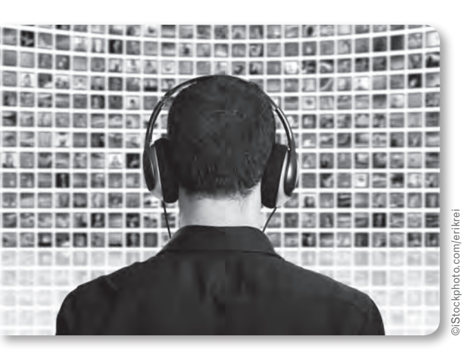
Exercising media literacy transforms the many discrete pieces of information you encounter through messages into an organized knowledge structure.

constructed with care and precision. They are not just a pile of facts; they are constructed by carefully crafting pieces of information into an overall design. The structure helps us see patterns. We use these patterns as maps to tell us where to get more information and also where to go to retrieve information that we have previously built into our knowledge structures.