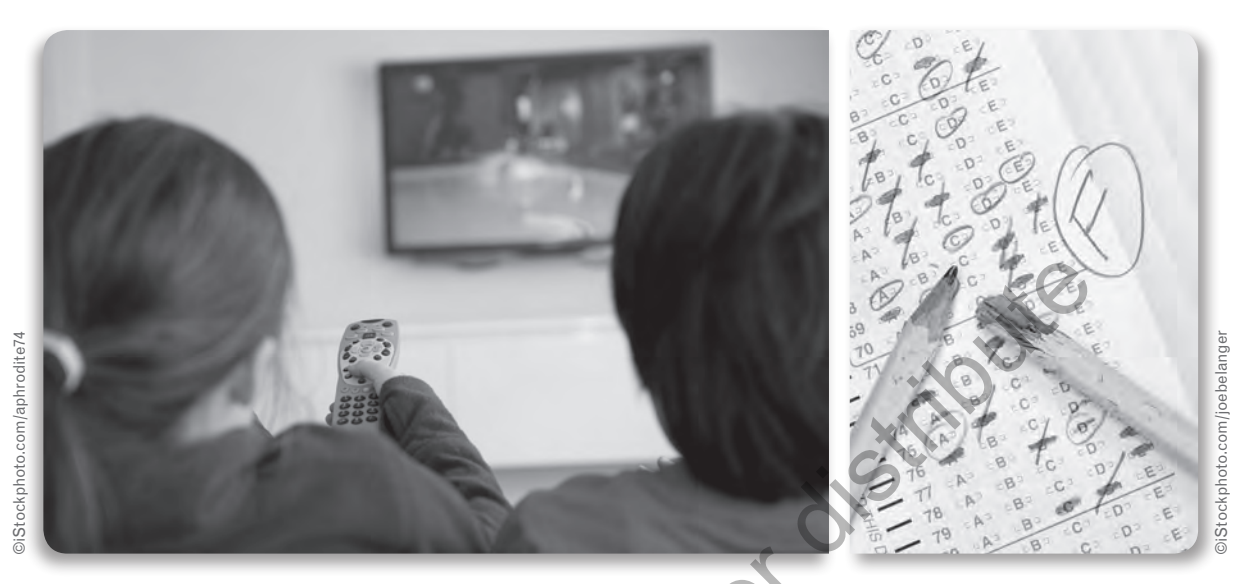
• Evaluation is an essential media literacy skill. Weigh the evidence against popular opinions on a possible link between children's media consumption and their academic performance.