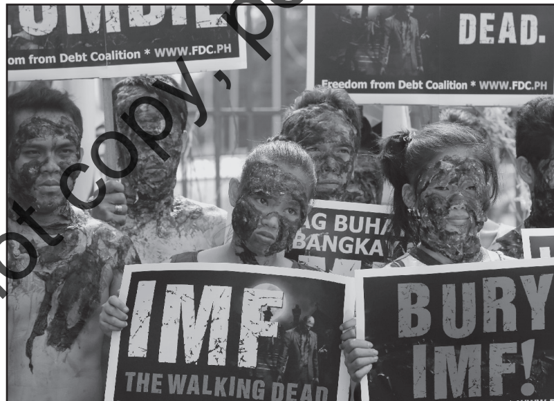
Protestors dressed like zombies at a rally against the visit of IMF Managing Director Christine Lagarde, Manila, November 2012.

The year 2009 was a banner year for the International Monetary Fund (IMF), as the global financial crisis instantly lifted the institution up from a steady decline in lending and legitimacy and put it back into the frontline of actors working to help countries hit hard by external and budgetary crises. The IMF's lending (arrangements approved) had dropped precipitously from over SDR 41 billion 3 in its fiscal year 2002 to SDR 600 million in 2007, as an improved global economy gave many developing countries alternative lending options, and the IMF suffered under the glare of a variety of critics. In 2008 it began cutting its staff, amid a shrinking loan portfolio. This all changed after the crisis hit. For the first time since the late 1970s, even developed countries were seeking help, including Iceland, whose economy faced a sharp meltdown as its banking system collapsed. In 2013, the biggest borrowers were not developing countries, but rather Greece, Portugal, and Ireland. 4 The IMF's role in the global financial crisis is the topic of Chapter 8.