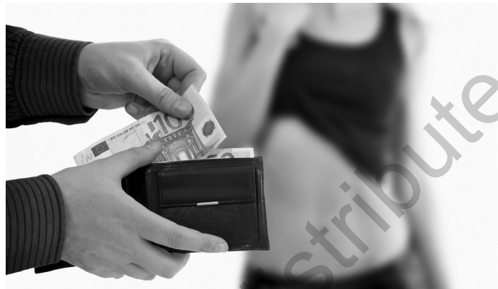
▲ Image 1.2 Prostitution is considered a mala prohibita offense because it is not inherently evil and is even legal in many jurisdictions around the world.

Most mala in se activities (e.g., murder) are highly deviant, too, meaning they are not typically found in society, but many, if not most, mala prohibita acts are not deviant because they are committed by most people at some point. Speeding on a highway is a good example of a mala prohibita act that is illegal but not deviant. This book will examine theories for all of these types of activities, even those that do not violate the law in a given jurisdiction at the present time.