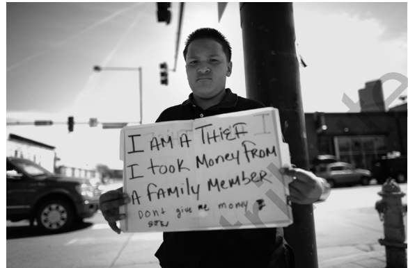
▲ Image 1.6 Offenders being forced to hold signs as part of their punishment is becoming a more popular informal sanction that shames individuals in their communities.

One of the key elements of a good theory is that it can help inform policy makers in making decisions about how to reduce crime. This theme will be reviewed at the end of each section in this book. After all, a criminological theory is only truly useful in the real world if it helps to reduce criminal offending. Many theories have been used as the basis of such changes in policy, and we will present examples of how the theories of crime discussed in each section have guided policy making. We will also examine empirical evidence for such policies, specifically to determine whether or not such policies have been successful (and many have not).