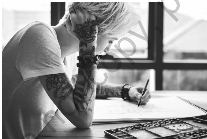
▲ Image 1.3 Early theories identified criminals by whether they had tattoos; at that time, this might have been true. In contemporary times, many individuals have tattoos, so this would not apply.

A more recent scientific debate has focused on whether delinquency is an outcome variable ( Y ) due to associations with delinquent peers and associates ( X ) or whether delinquency ( X ) causes associations with delinquent peers and associates ( Y ), which then leads to even more delinquency. This can be seen as the argu-