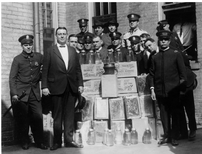
▲ Image 1.5 Group portrait of a police department liquor squad posing with cases of confiscated alcohol and distilling equipment during Prohibition.