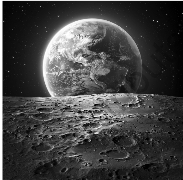
▲ Image 1.1 Earth seen from the surface of the moon. Theories of Earth as the center of the universe were dominant for many centuries, and scientists who proposed that Earth was not the center of the universe were often persecuted. Over time, the theory was proved false.

Two things should be clear: Theories can be erroneous, and accurate predictions can be made (e.g., early calendars and moon and star charts) using them, even though there is no true understanding of what is actually happening. One way to address both of these issues is to base knowledge and theories on scientific observation and testing. All respected theories of crime in the modern era are based on science; thus, we try to avoid buying into and applying theories that are inaccurate, and we continuously refine and improve our theories (based on findings from scientific testing) to gain a better understanding of what causes people to commit crime. Criminology, as a science, always allows and even welcomes criticism of its existing theoretical models. There is no emphasis on authority but rather on the scientific method and the quality of the observations that take place in testing the predictions. All scientific theories can be improved, and they are improved only through observation and empirical testing.