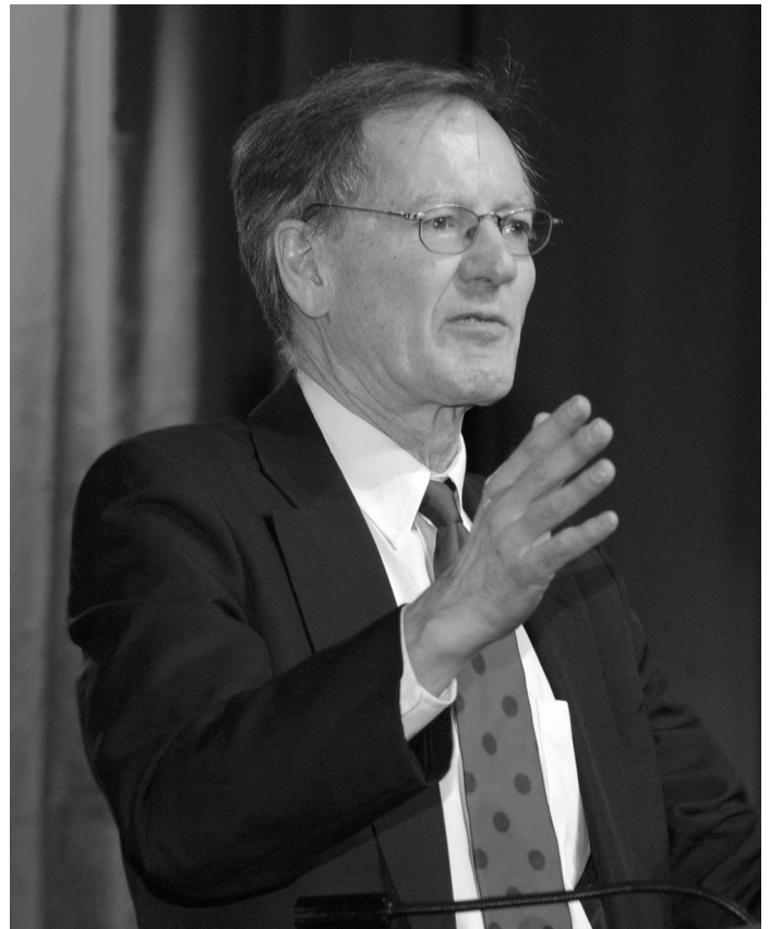
George Gilder's research into society and poverty resulted in a string of influential books on supply-side economics.

Indeed Gilder's association with pioneering supply-side economics was furthered by his involvement in several public forums, such as the Lehrman Institute's Economics Roundtable, the Manhattan Institute, A.B. Laffer's economic reports, and contributions to the