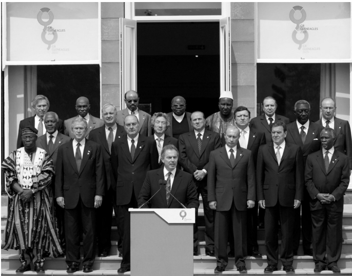
The 2005 G-8 Summit, with the eight leaders and accompanying dignitaries behind British Prime Minister Tony Blair.

rope have made political issues just as central to G-8 summits as economic ones. The scope of G-8 meetings has expanded even more in recent years to include international political and social issues such as debt-relief to developing countries, the threats of terrorism worldwide, and organized crime, environmental, and health-care problems.