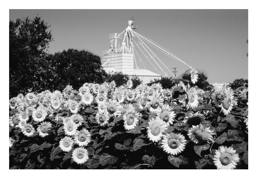
FIGURE 2 Sunflowers and silo, Garden City, Kansas, USA