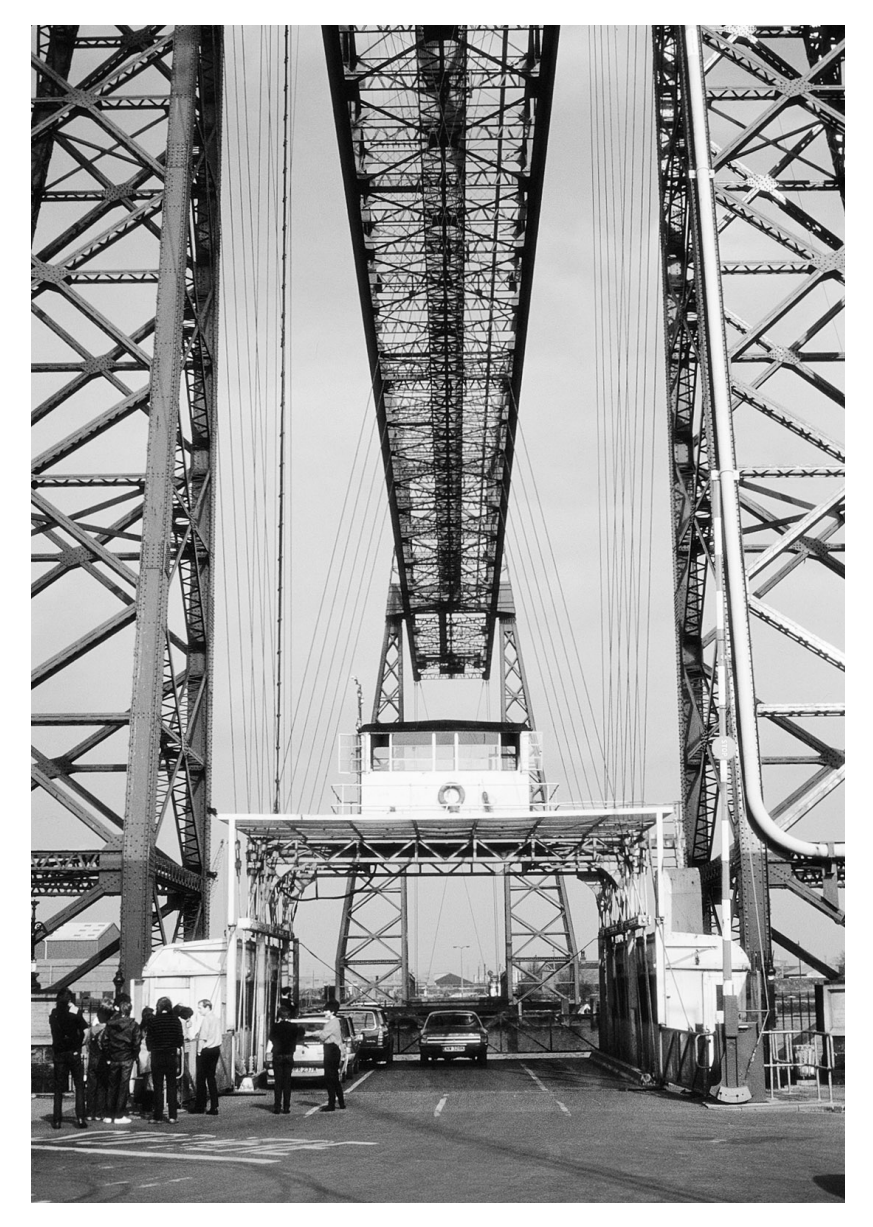
FIGURE | Transporter Bridge, Middlesbrough, England